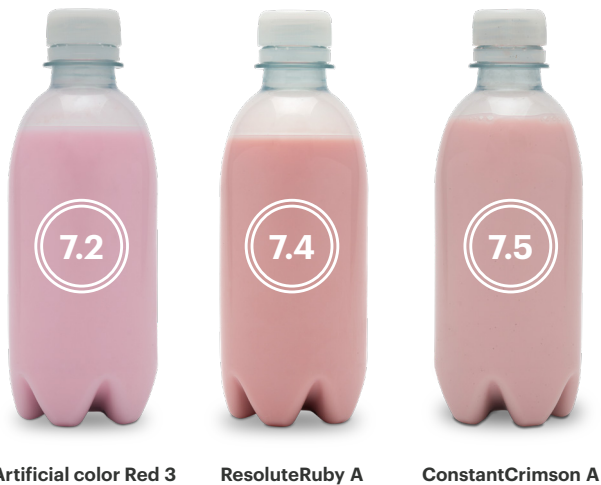
Figure 1: Both Lycored natural red colors outscored the artificial sample on naturalness

In the emotional profiling exercise, the key equities most associated with each sample were ordered from top to bottom. No significant differences emerged between the three emotional profiles, with qualities such as happy, friendly and youthful associated with all three. However, the Lycored natural red products scored directionally higher on positive key equities: ConstantCrimson A was perceived as distinctive and trustworthy, and ResoluteRuby A emerged as playful, fun and simple.