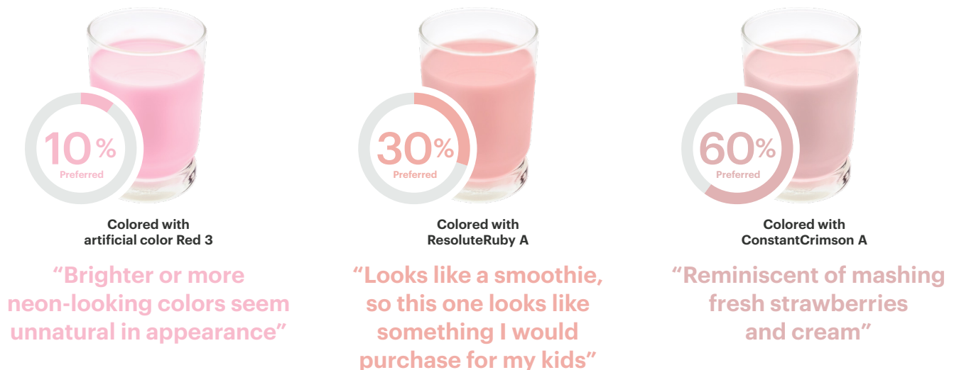
Figure 3: Nine out of ten consumers in focus groups preferred the appearance of the natural options

Participants were finally asked if they would consider changing from their current brand of strawberry-milk to one colored with their preference from the three samples. All three opinion-formers said they would consider switching because of the more natural appearance of ConstantCrimson A. The fact that it looked more like a smoothie was frequently mentioned and respondents commented that the more artificial food coloring looks, the less likely they are to buy the product. One of the mothers said: “If the color looks chemically engineered, I won’t bring it home for my kids to put in their growing bodies. If the color seems natural, I would investigate the ingredients on the label to confirm. If everything was free of synthetic ingredients, I would definitely make the switch.”