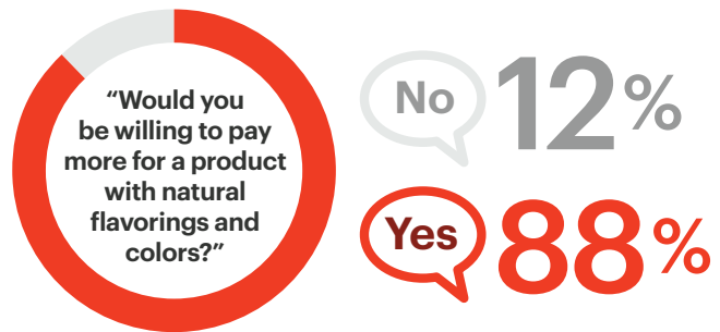
Figure 2: Consumers are willing to pay significantly more for a product with natural flavors and colors

Significantly more mums aged 18-40 (90%) are likely to pay more, compared to mums aged 41-65 (84%)