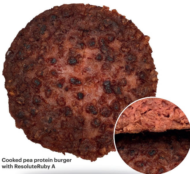
Cooked pea protein burger with ResoluteRuby A