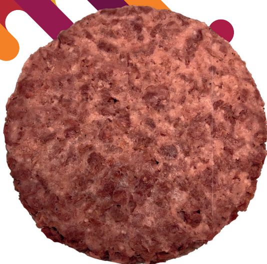
Raw pea protein burger with ResoluteRuby A